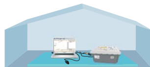
Application in laboratories