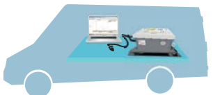
Application on vehicles