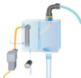
Diagram of Pretreatment System (optional)